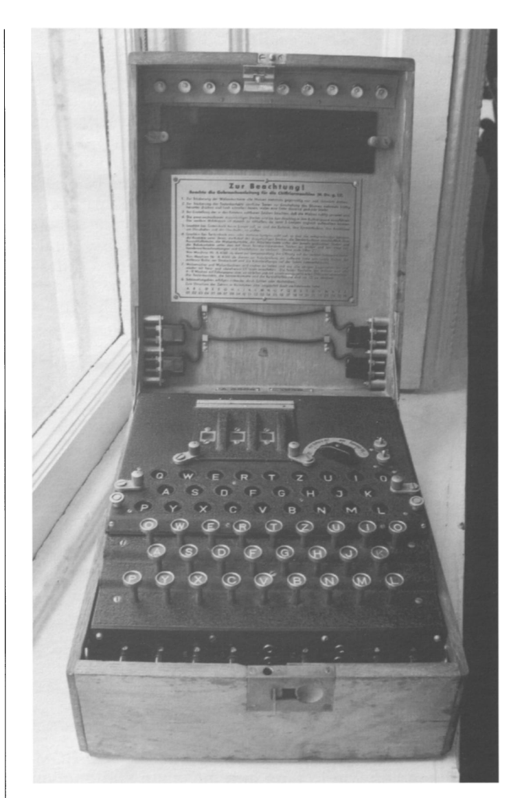
Second World War Enigma Cipher Machine

One of the pivotal breakthroughs in cryptography was the invention of the Enigma cipher machine which mechanized encryption and foiled frequency analysis. The machine looks like a typewriter and essentially has three components. First, there is an input keyboard. Second, there is an output lampboard. Third, in between the keyboard and lampboard, there is a scrambling device, which means that typing A might cause the letter M to light up on the lampboard. Crucially, the scrambling part of the Enigma has a dynamic element, which means that the scrambling mode changes after each letter is typed, so inputting A several times will